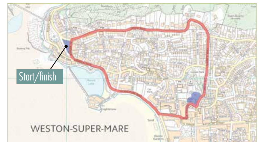
You are not permitted to copy, sub-license, distribute or sell this data to third parties in any form.